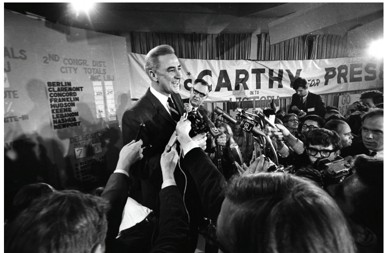
Eugene McCarthy speaks at a campaign event.

To more clearly highlight the importance contribution limits play in changing the timing and viability of campaigns, Eugene McCarthy's famous 1968 candidacy is instructive. The anti-war Senator and presidential candidate, who forced incumbent President Lyndon Johnson from the 1968 Democratic primary, would almost certainly not have been able to mount a competitive campaign under today's restrictive laws. As syndicated columnist Richard Cohen has noted, “[h]istory was changed by the sort of political donations that are now derided.” 6